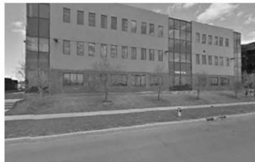
11420 27 St SE Calgary, AB T2Z 3R6

We are in the 3 story building on the right side. The office faces the parking lot, not the main road. Phone numbers remain the same (403) 547-9709, or St. Albert can be reached at (800) 665-6836.